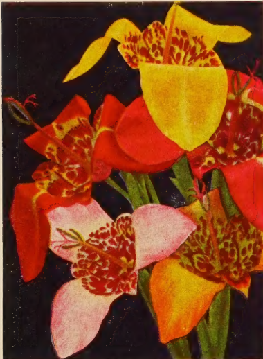
TIGRIDIA, MIXED COLORS. 25 for $1.90